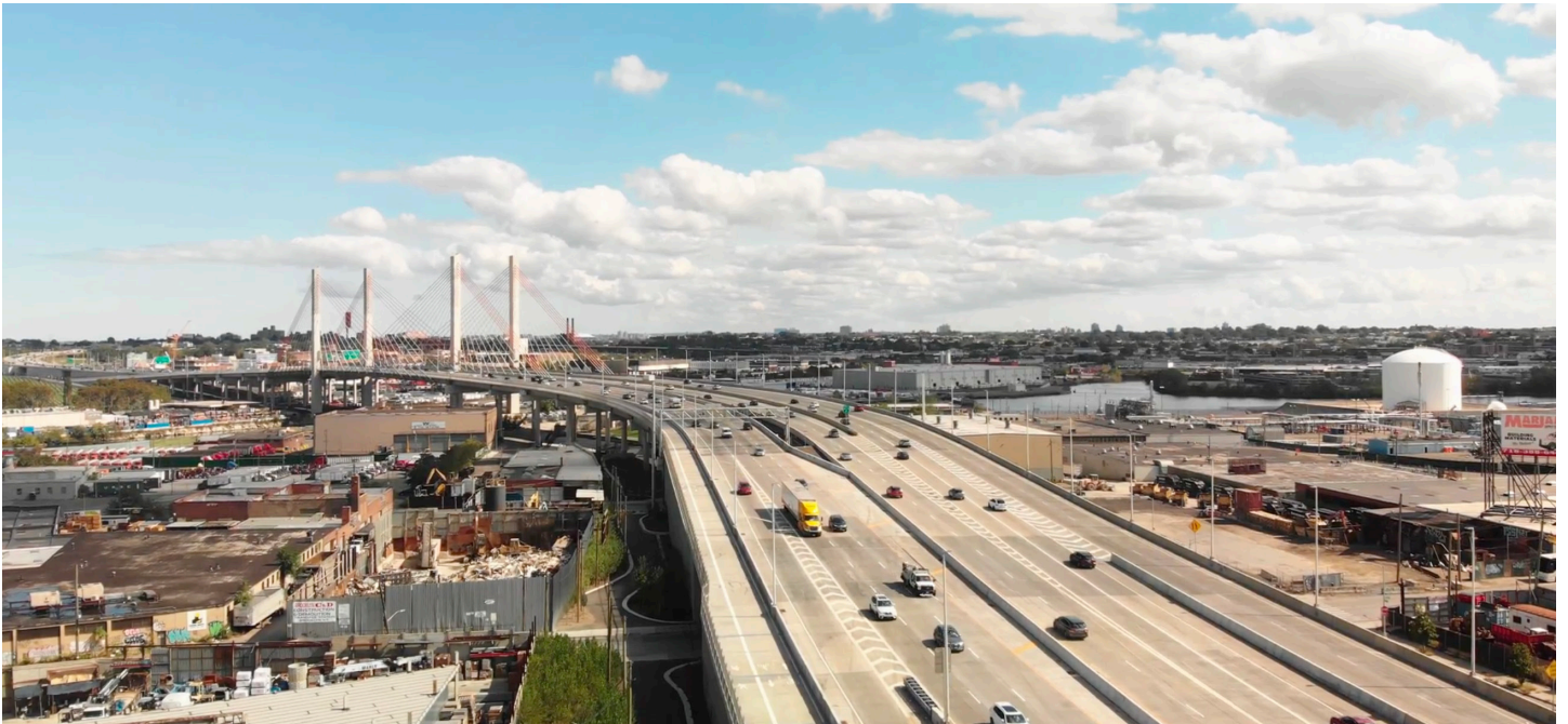
Aerial view of The Kosciuszko Bridge, BQE, and Under the K Bridge Park in Greenpoint, Brooklyn.

February 10, 2023 — Brooklyn, NY | Communities throughout Brooklyn are facing a once-in-a-lifetime opportunity to reimagine one of the area's most infamous roadways: the Brooklyn-Queens Expressway (BQE). Since 1937, the borough has been divided by the daunting transportation infrastructure, envisioned by Robert Moses, which either cut a trench or built an elevated highway bifurcating historic neighborhoods.