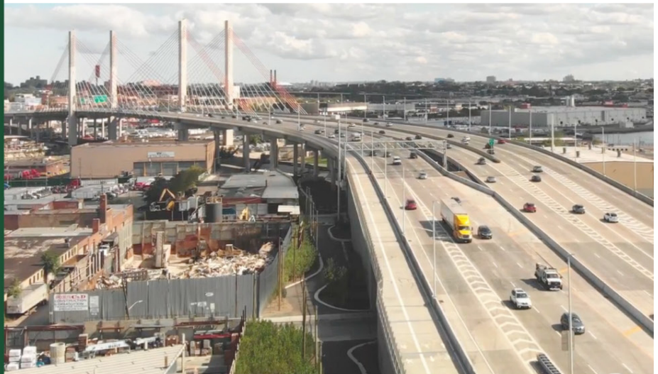
Image: Aerial view of Under the K Bridge Park in Greenpoint

*Bushwick Inlet Park Building. Childcare + Translators provided.